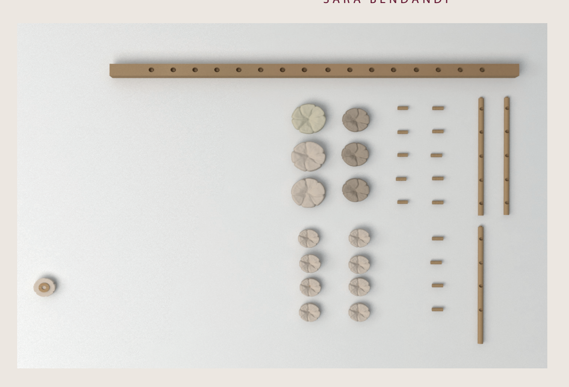
VISUAL & ILLUSTRATION BY SARA BENDANDI

The room divider is completely modular and can easily be assembled or disassembled. In this way the product has a lower environmental impact as it can be shipped in a smaller box. Nevertheless, when the product isn't used anymore all elements can be placed within the correct recycle method. The Eggshell Ceramic elements can be added to a compost bin. This will be beneficial for the soil as it then returns it calcium back to nature. The designed frame is made from European Douglas Fir and coloured with Satin Wood Oil from